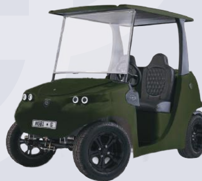
OLIVE GREEN MATTE BLACK RIMS